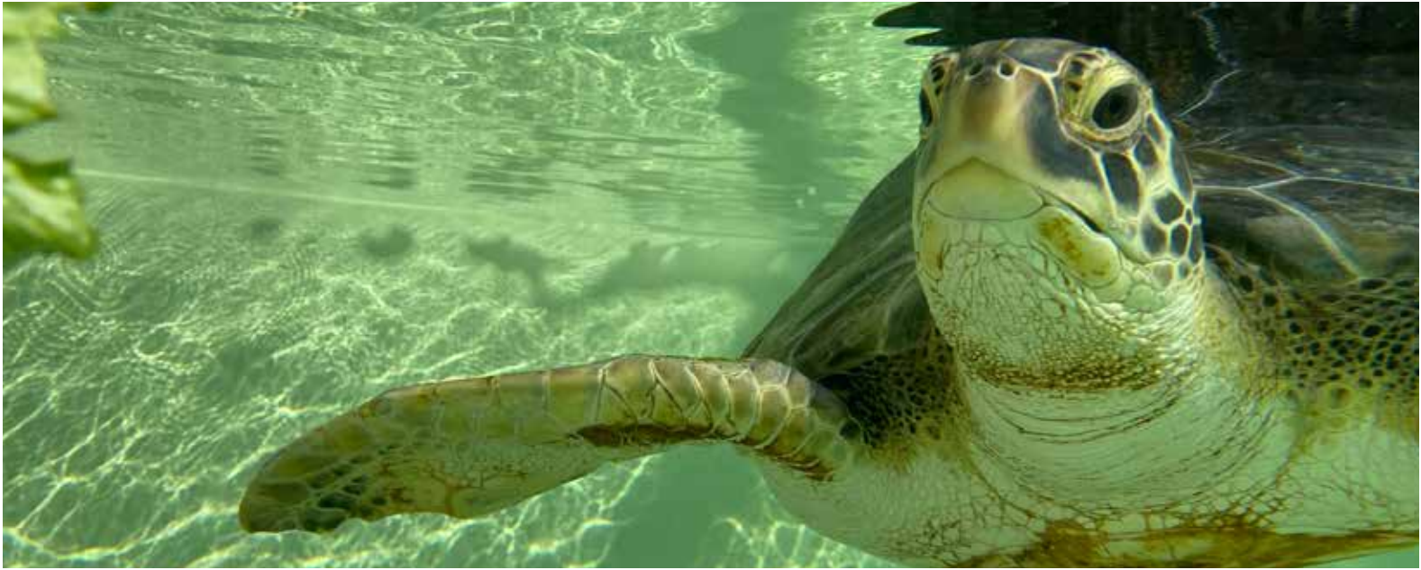
Atlantic Green Sea Turtle